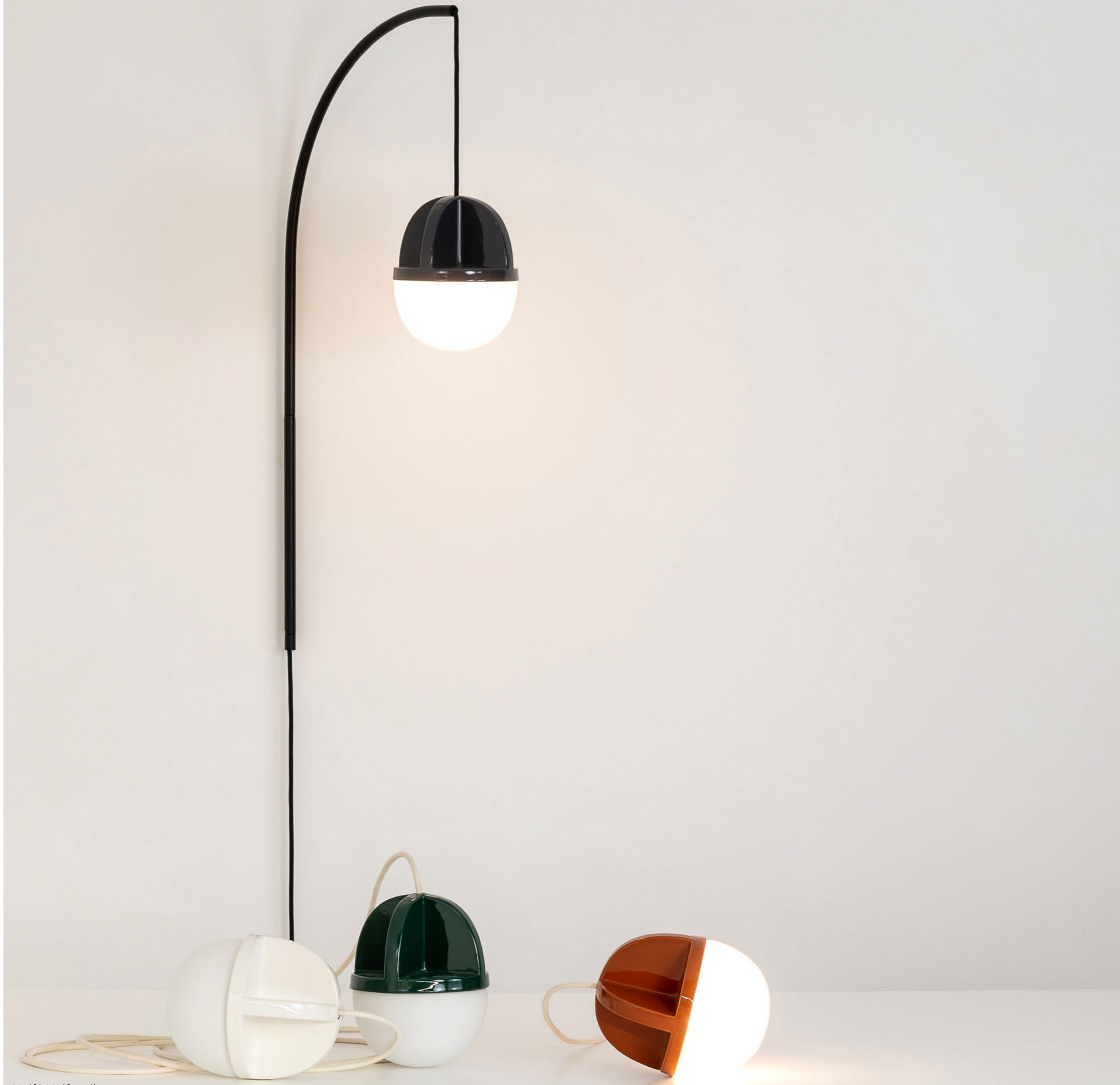
Half&Half wall Smooth-Green-Toscan