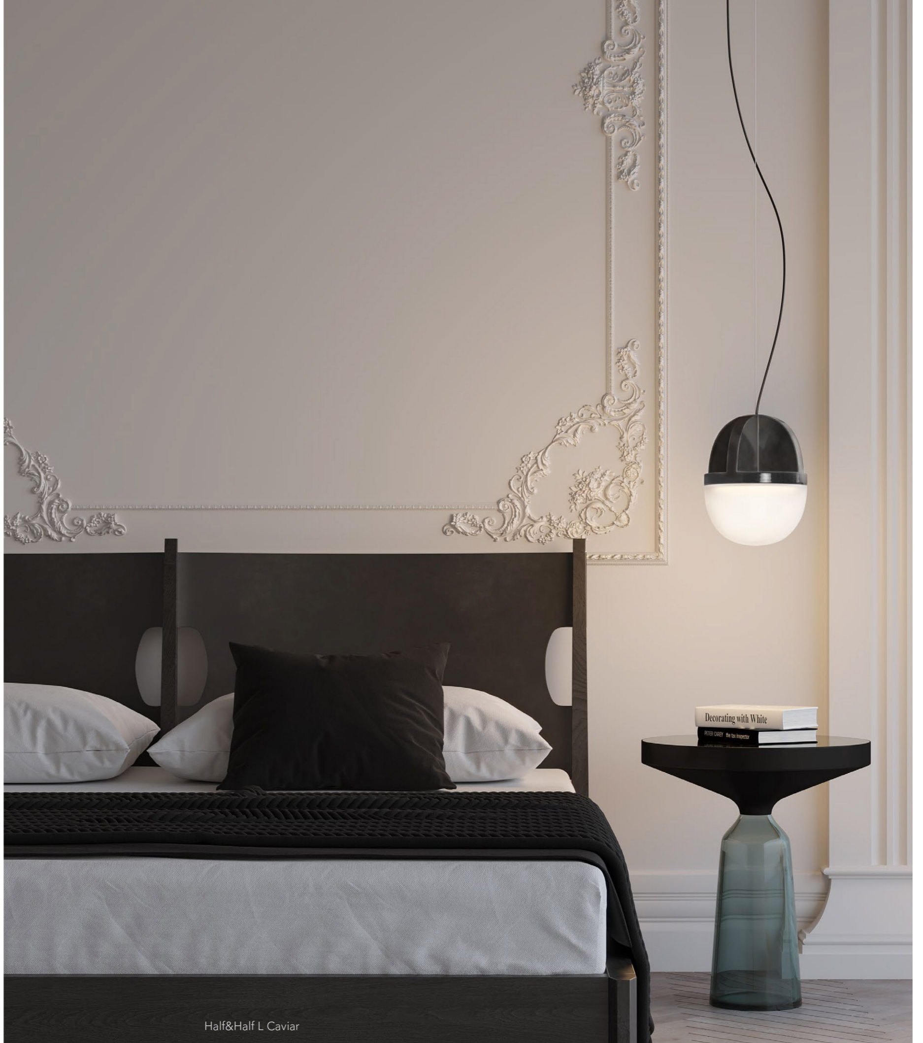
Half&Half L Caviar