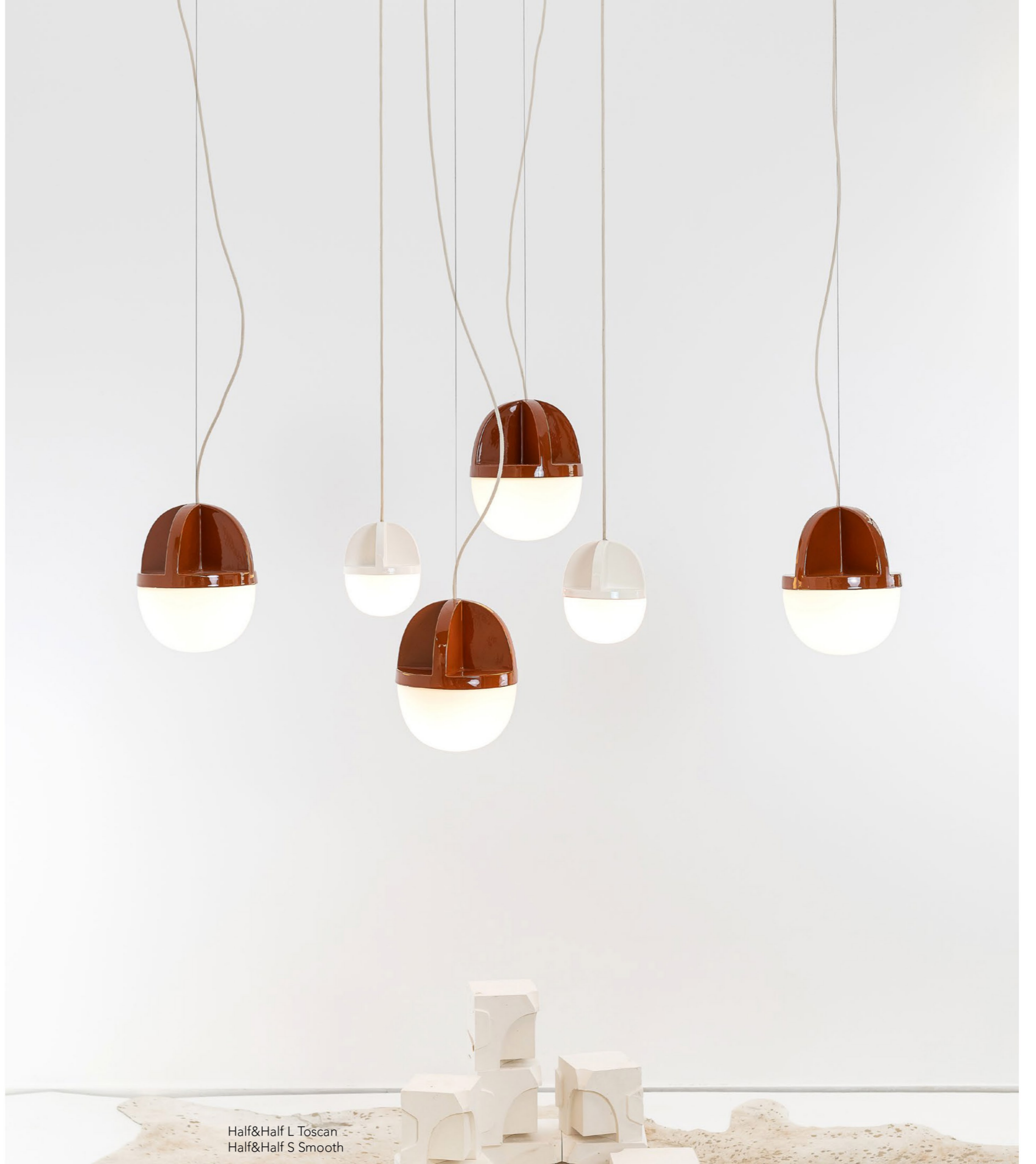
Half&Half L Toscan Half&Half S Smooth